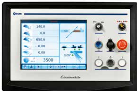
easy touch 12"