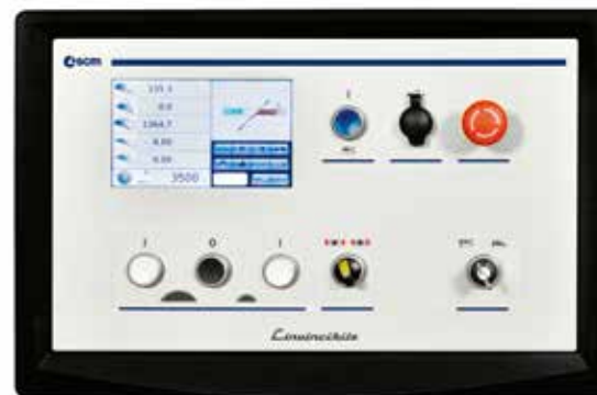
easy touch 7"